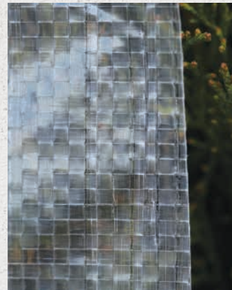
DURAWEAVE 8 MIL WOVEN 8 MIL, 88% TRANSMISSION

AVAILABLE IN PRE-CUT WIDTHS RANGING FROM 20' - 50' AND LENGTHS 50' - 150'.