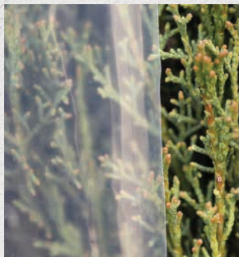
DIFFUSED POLY NON-WOVEN 90% TRANSMISSION