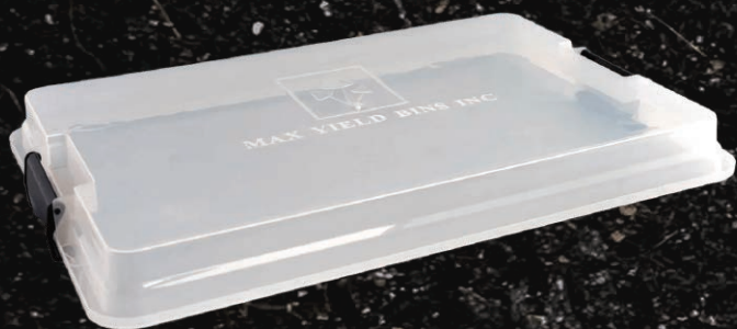
EXAMPLE, COLONIZER LID IN USE

The adhesive filter patches for the Max Yield Bin promote ideal airflow while maintaining humidity levels and preventing unwanted contaminants from entering your monotub during growth. Each filter pack contains 24 perfectly sized filters with a 3M adhesive backing for easy attachment and replacement.