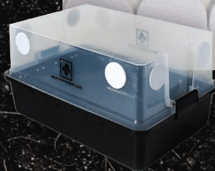
EXAMPLE, FILTERS IN USE