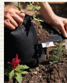
VELCRO FOR ROOT PROTECTION WHEN TRANSPLANTING