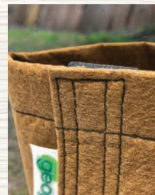
DOUBLE-STITCHING WITH MARINE- GRADE THREAD

Velcro and Handles are not available in all sizes and colors. To see the full list of availability and pricing, visit our website.