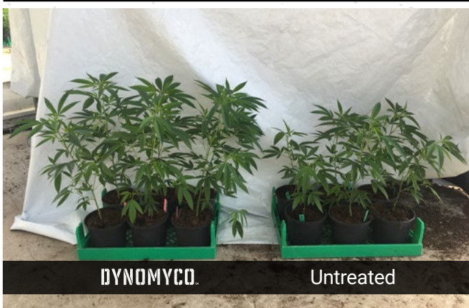
Seàch Farm, Israel, 2018 – In an ongoing cannabis trial (Black Label cultivar), DYNOMYCO™-treated plants showed a 15% higher growth rate (height and stem), 30 days after treatment.