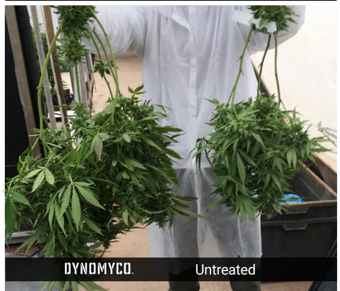
Pharmacann LTD, Israel, 2018 - Cannabis plants treated with DYNOMYCO™ showed a 19% increase in flower yield and a 5% increase in stem width (Ella cultivar).